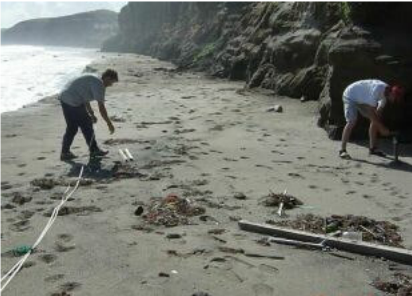
Figure 5: Stakes placement