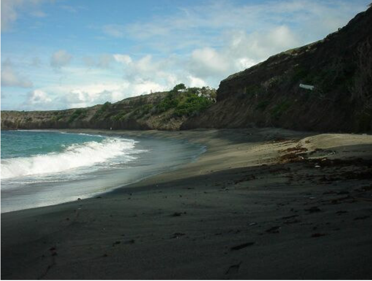
Figure 4: Turtle beach

Lynch beach is a rocky beach covered by ground vegetation; the beach morning glory. Lynch beach hosts a nesting habitat for Hawksbill turtles and Green turtles as well as (possibly) Loggerheads. Lynch beach is stable due to the adjacent rocky and reef barrier that provides a natural shelter for sand retention.