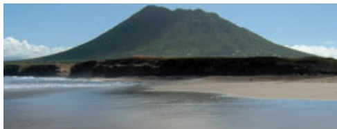
Figure 3: Zeelandia beach

Zeelandia beach (Figure 3) is highly active and sand erosion is continuous. Direct access to the beach from the Atlantic deep sea for Leatherback Turtles is restricted to the first 780 meters of the beach with 94 % of Leatherback nesting activities observed within the first 420 meters of beach. Zeelandia Beach is a nesting site for Green (68% of Green turtle nesting activities of 2004) and Hawksbill turtles. Zeelandia is the only beach monitored at night by STENAPA.