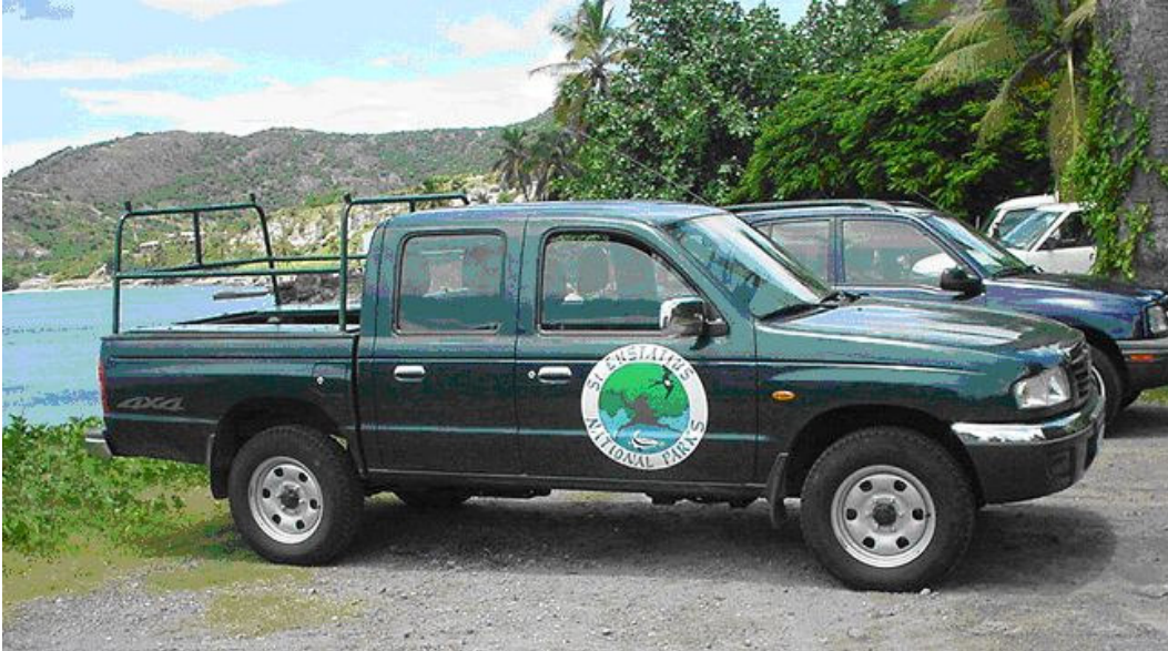
Figure 6: New vehicle for the monitoring programme