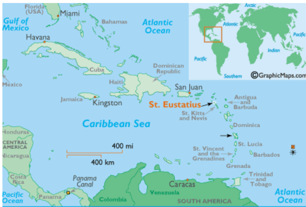
Figure 1: Map of St Eustatius in the Eastern Caribbean

The island of St Eustatius is located in the Windward Islands and is part of the Netherlands Antilles. St Eustatius lies within the longitude and latitude median of 17°30 North and 62°58 West. Sister islands of Saba and St Maarten stretch out 30 Km north-west and 63 Km north of St Eustatius respectively. St Eustatius is 21km 2 in size and is made up of an extinct volcano comprising the “Northern Hills” to the north (150 Million years old) and a dormant volcano called the “Quill” to the south formed 22000 to 32000 years ago. Because of its volcanic origin, the beaches of St Eustatius are made of dark sand.