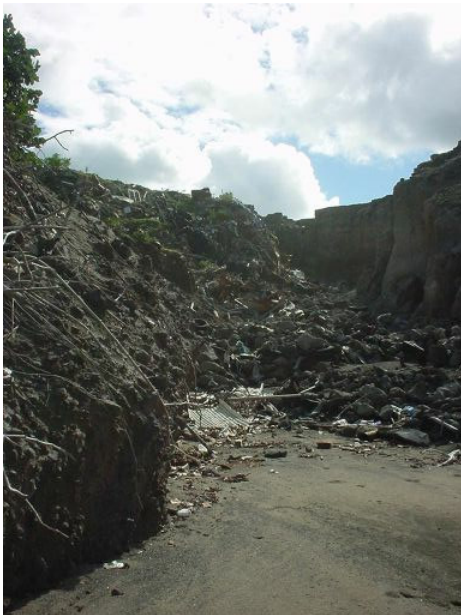
Figure 9: Closed landfill on Turtle Beach (still being used)

Further south on Turtle beach is an old landfill (Figure 9). Although it was closed down in 2003, the turtle programme coordinator has observed sporadic use of the landfill by residents while on day patrols. This landfill still spills over on the beach with high seas. Marine Park rangers are continuously picking up plastic bags afloat at sea while patrolling.