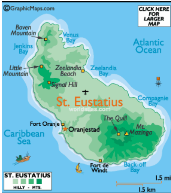
Figure 2: Map of St Eustatius (DWI)

Zeelandia beach (Figure 3) is highly active and sand erosion is continuous. Direct access to the beach from the Atlantic deep sea for Leatherback Turtles is restricted to the first 780 meters of the beach with 94 % of Leatherback nesting activities observed within the first 420 meters of beach. Zeelandia Beach is a nesting site for Green (68% of Green turtle nesting activities of 2004) and Hawksbill turtles. Zeelandia is the only beach monitored at night by STENAPA.